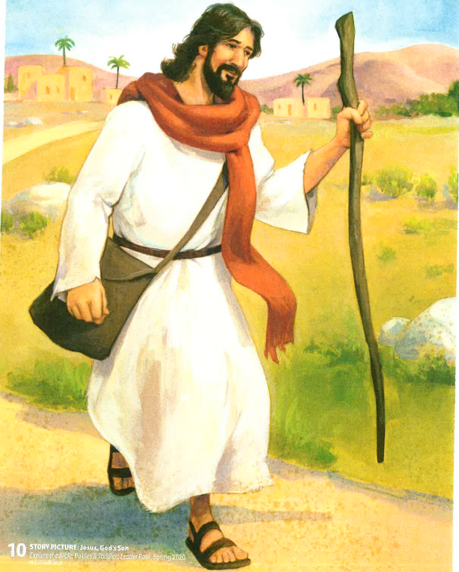
10 STORY PICTURE: Jesus, God's Son Explore the Bible: Babies & Toddlers Leader Pack, Spring 2020 © 2019 LifeWay