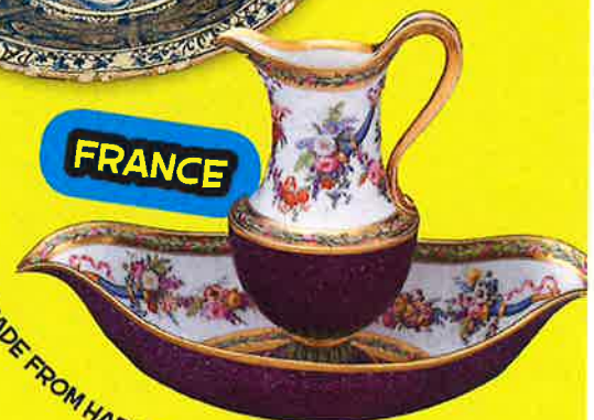
THIS BASIN WAS MADE FROM HARD-PASTE PORCELAIN IN 1795