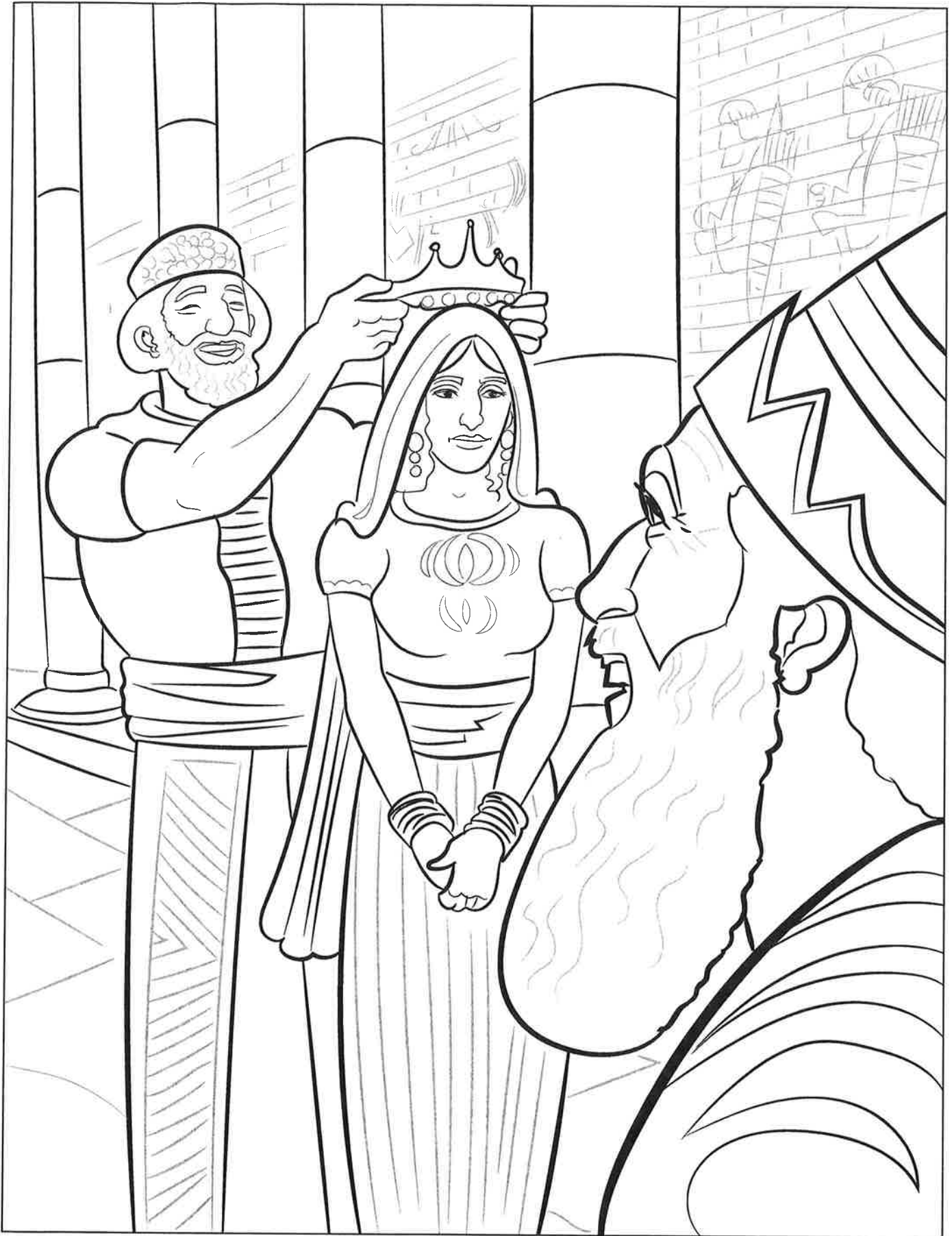
Story Picture Page 13: Esther Became a Queen Explore the Bible: Preschool Enhanced CD, Spring 2020