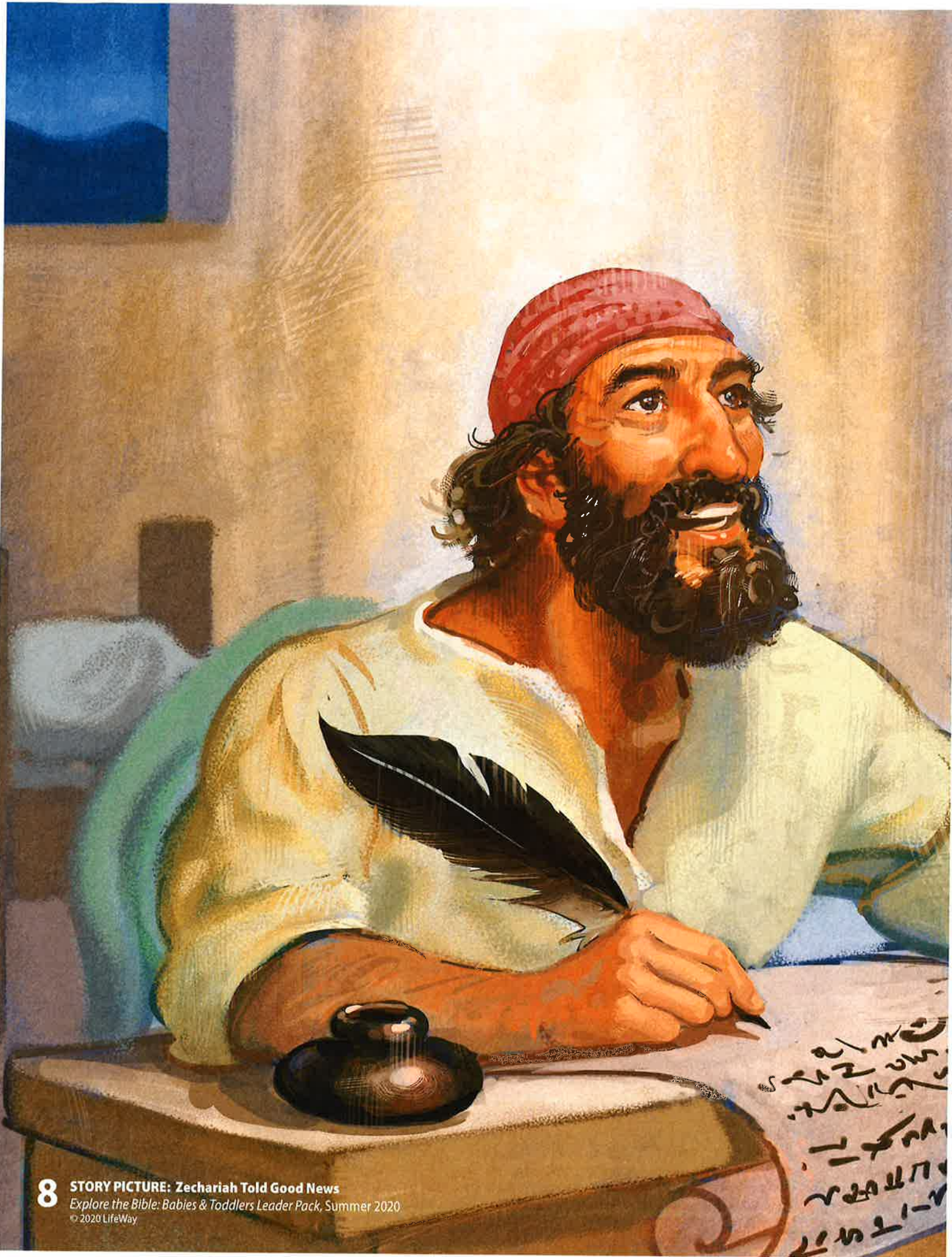
8 STORY PICTURE: Zechariah Told Good News Explore the Bible: Babies & Toddlers Leader Pack, Summer 2020