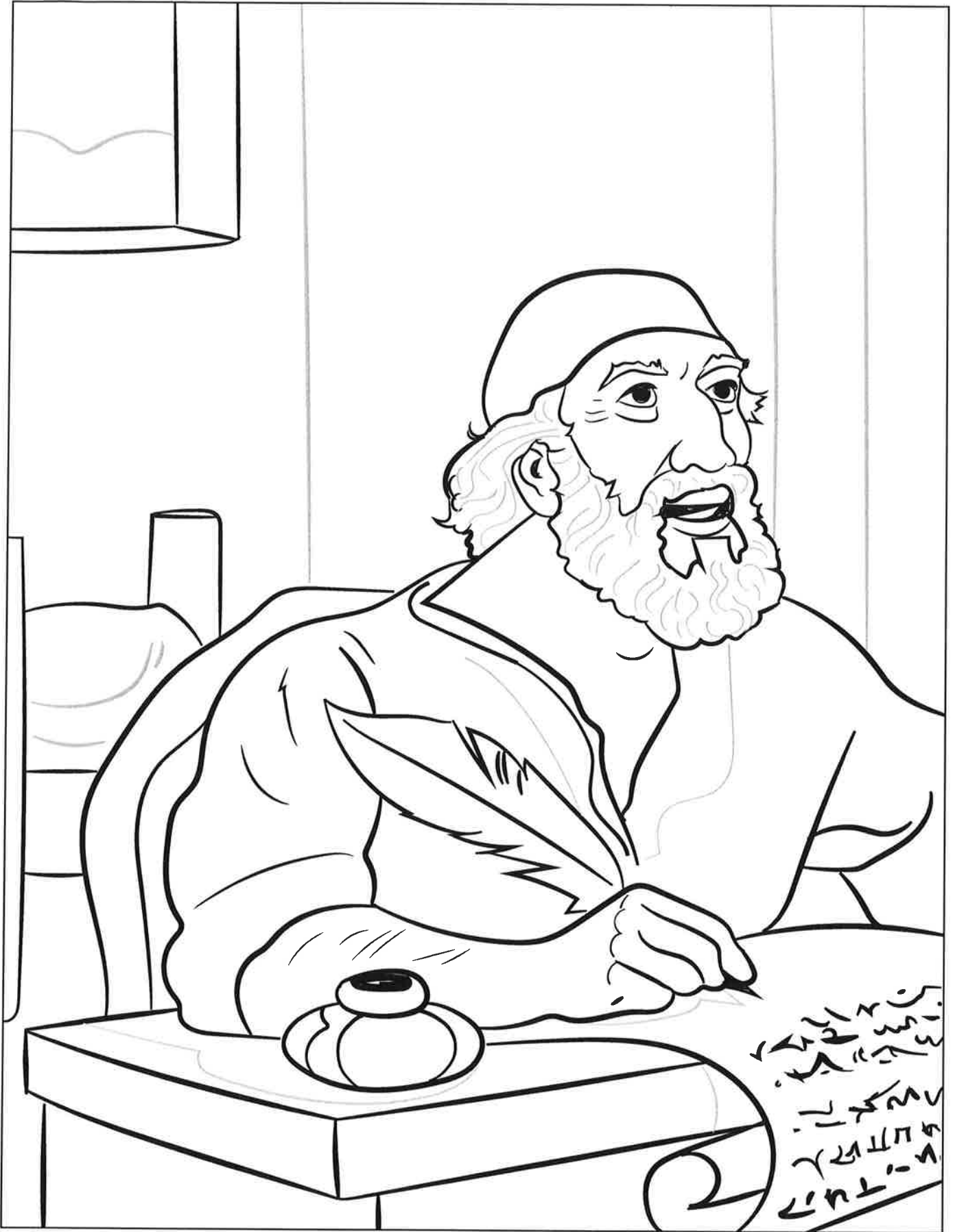
Story Picture Page 8: Zechariah Told Good News Explore the Bible: Preschool Enhanced CD, Summer 2020 © 2020 LifeWay. OK to copy.