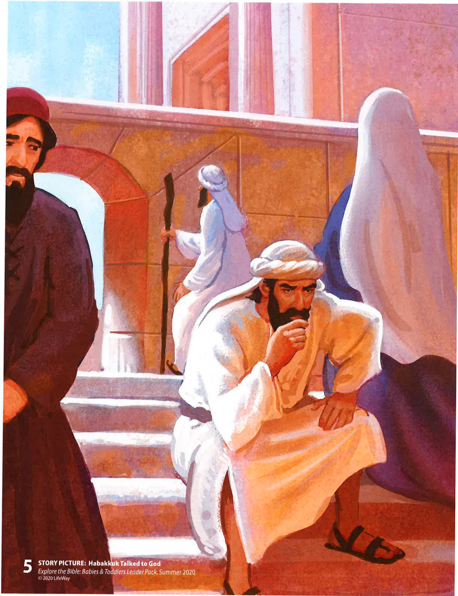
5 STORY PICTURE: Habakkuk Talked to God Explore the Bible: Babies & Toddlers Leader Pack, Summer 2020 © 2020 LifeWay