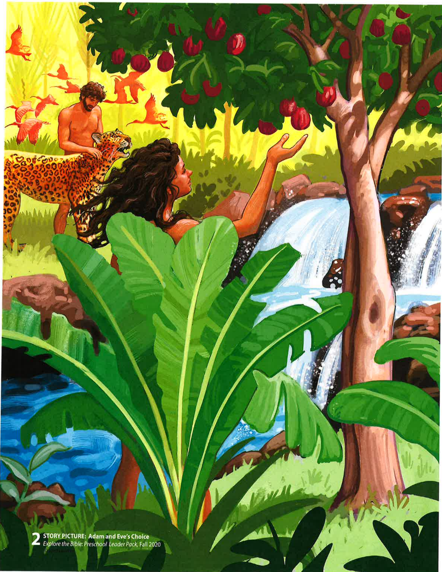
2 STORY PICTURE: Adam and Eve's Choice Explore the Bible: Preschool Leader Pack, Fall 2020