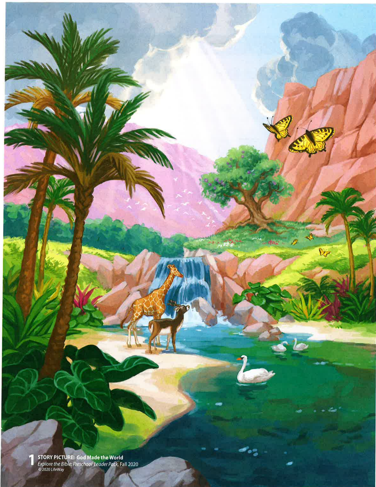
1 STORY PICTURE: God Made the World Explore the Bible: Preschool Leader Pack, Fall 2020