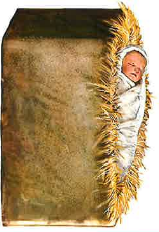
Baby Jesus in manger