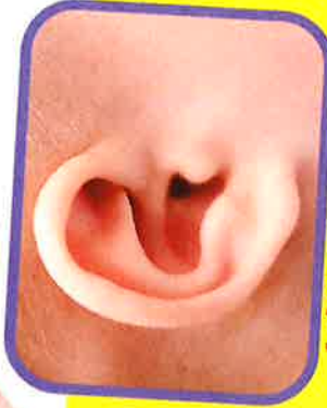
With my ears