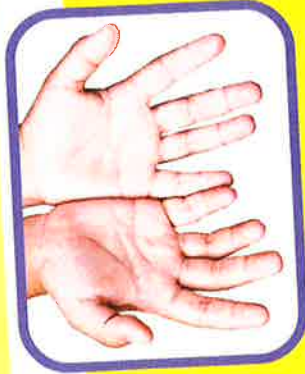
With my hands