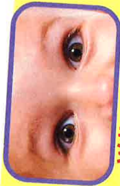
With my eyes