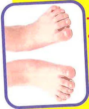
With my feet