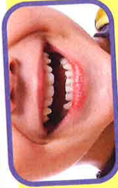
With my voice