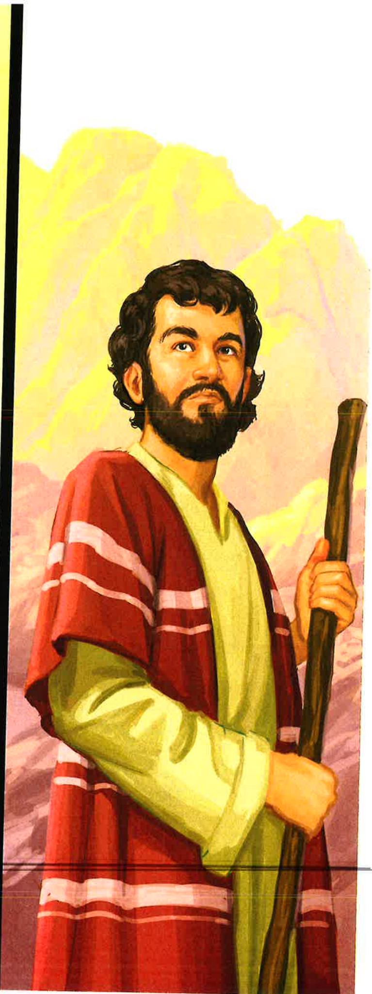
5 STORY PICTURE: Moses in Egypt Explore the Bible: Babies & Toddlers Leader Pack, Winter 2020-21